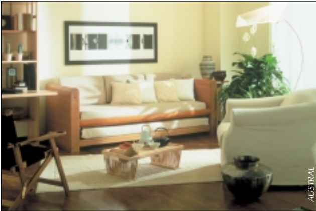
A healthy interior

The air within homes can be more polluted than the outdoor air. Although we spend most of our time indoors, the focus tends to be on outdoor air quality. Design that is sensitive to air quality issues can have a major impact on our health and wellbeing.